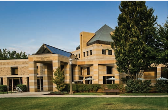
Hesburgh Center for International Studies