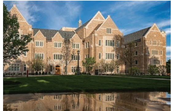
Jenkins and Nanovic Halls