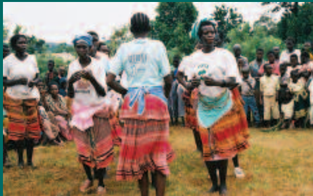
Ugandan dancers share their talent with parishioners and their guests

While the facility was not ornate, it did ably fulfill its purpose: keeping off the rain. As the rain grew heavier throughout the morning, a throng of people — several hundred by my count — squeezed together under this roof to sing joyful, rhythmic songs of worship.