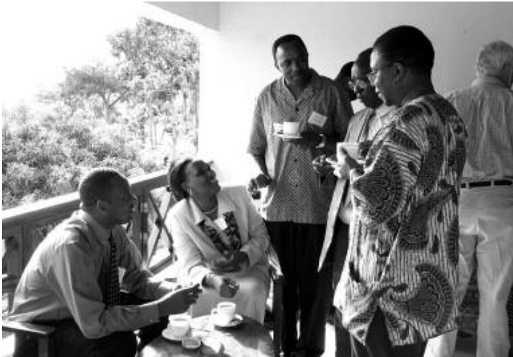
Conferees take a break between intense discussions