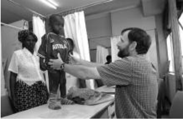
An international worker, as seen by photojournalist and conference participant Karl Grobl

International aid workers are no longer just caught in the crossfire of conflicts; they are sometimes targets. Even outside of war zones, they can face emotional trauma, overwork, separation from families, questioning of values, burnout, and difficulty readjusting to life at home.