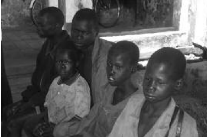
Boys who were abducted or raised as soldiers by rebel forces

The Acholi religious leaders' efforts seem to be bearing fruits with the introduction in April of a bill by two U.S. senators (Lamar Alexander, Republican, Tennessee and Russ Feingold, Democrat, Wisconsin) calling for a report within six months from Secretary of State Colin Powell on the sources of support to the LRA, and the