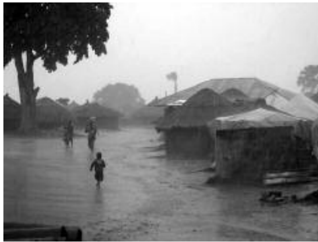
Rain pounds a displaced persons camp in Northern Uganda

appropriate steps about how to generate more diplomatic activity. Being a professor I was invited to speak to students in conflict management and development studies at the new Gulu University. Having an interest in the media, I was interviewed on a local community radio station which broadcasts to the camps. Being a woman with an interest in human rights, I was drawn into discussions with women political leaders expressing outrage at the exploitation and suffering of women. Claiming the label of anthropologist and scholar of religion, I was asked to comment on the stories of Kony's spiritual powers and ritual practices. Since I returned to