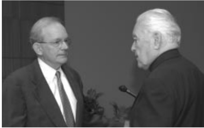
Anthony Lake talks with Fr. Theodore M. Hesburgh, C.S.C.

But given the realities of the world, we need to think about the exceptions to the rule. There are many critical questions which must be asked in this context: What is the scope of the humanitarian crisis? How are our interests or other's interests affected? Is reconciliation still possible in the practical sense? Have all diplomatic means to hold the country together been attempted, or at least considered? Has a state's behavior in the face of separatist movements become so reprehensible