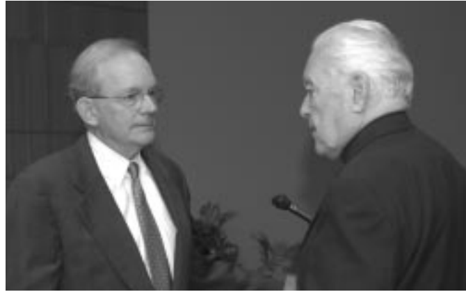
Anthony Lake talks with Fr. Theodore M. Hesburgh, C.S.C.

But given the realities of the world, we need to think about the exceptions to the rule. There are many critical questions which must be asked in this context: What is the scope of the humanitarian crisis? How are our interests or other's interests affected? Is reconciliation still possible in the practical sense? Have all diplomatic means to hold the country together been attempted, or at least considered? Has a state's behavior in the face of separatist movements become so reprehensible