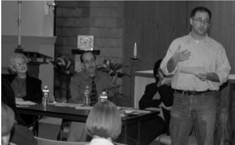
Faculty met with students in their dorms during the “Week of Education on Peace and War,” November 11-16.