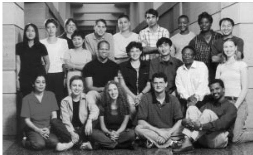
The Kroc Institute’s 2001-02 M.A. Students

Biographies of these students are available on the Kroc Institute’s website < www.nd.edu/~krocinst >.