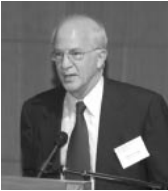
Chester Crocker, Chair of USIP's Board of Directors

The tension between pursuing truth and justice, on the one hand, and guarding a fragile peace generated by settlements or negotiated regime transitions, on the other, frequently places human rights and peacemaking practitioners at odds. To explore the implications of this tension for the research and