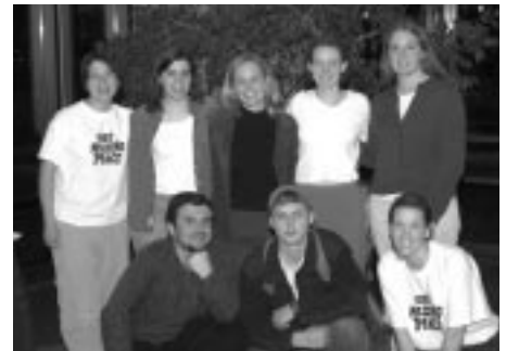
Conference Planning Committee

A Notre Dame student who had visited Nepal presented research on child labor practices in the carpet and sex trafficking industries in Nepal after seeing how a young