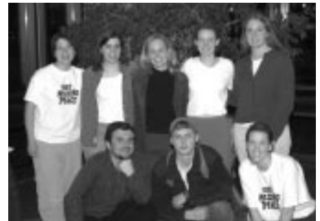
Conference Planning Committee

A Notre Dame student who had visited Nepal presented research on child labor practices in the carpet and sex trafficking industries in Nepal after seeing how a young