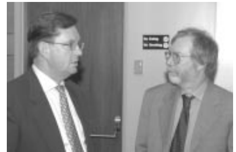
Raimo Väyrynen with Paul Collier

The project ultimately hopes to contribute to national and international economic policy decisions. Through its comparative approach, the project will identify how particular policy choices regarding integration in the global economy interact with local factors to either foment or mitigate violent conflict.