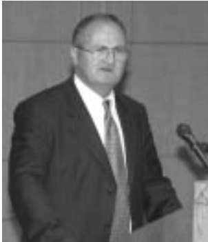
Martin Van Creveld

Martin van Creveld, author of The Rise and Decline of the State (1999) among many other seminal works, presented the