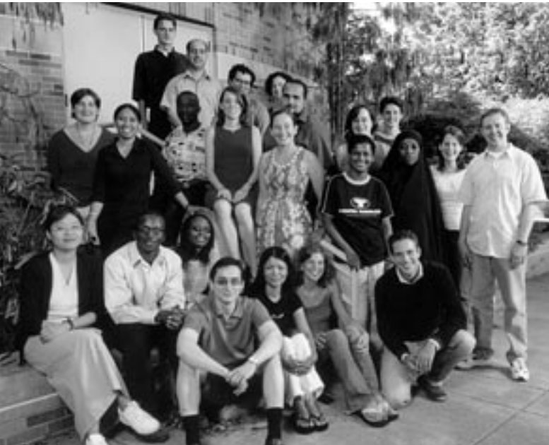
The Kroc Institute's 2002-03 M.A. Students