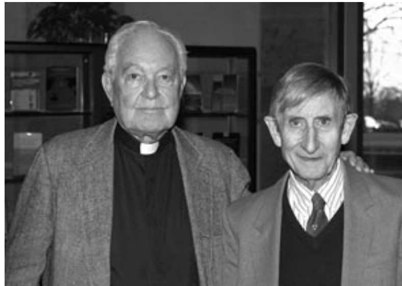
Freeman Dyson with Fr. Theodore Hesburgh, C.S.C.

SELF, the Solar Electric Light Fund, a private foundation in Washington, D.C., supplies solar panels to generate electricity from sunlight. Small, inexpensive solar panel systems generate enough electricity in homes to run fluorescent lights, a radio, phone and a television. Children read and study more. Adults can lengthen their work-day and add to family income by producing marketable