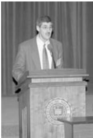
John Paul Lederach reflected on the influence of John Howard Yoder on his approach to peacebuilding.

Yoder also made substantial contributions to the development of the "Believer's Church Conferences." The term "Believer's Church" was coined by Max Weber to emphasize the voluntary character of several radical Protestant groups, and the term gained currency in the literature by and about these groups. The conferences draw together theologians, ministers, and lay people, predominantly from Mennonite, Brethren, and Quaker traditions, and observers from other denominations, to discuss issues at the intersection of theology and practice. Yoder helped