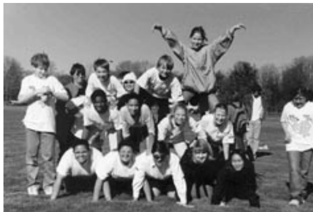
Notre Dame students and Take Ten peace ambassadors build relationships during an informal gathering.