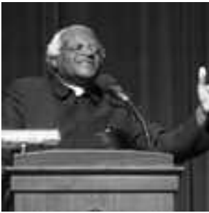
Archbishop Emeritus Desmond Tutu at Notre Dame