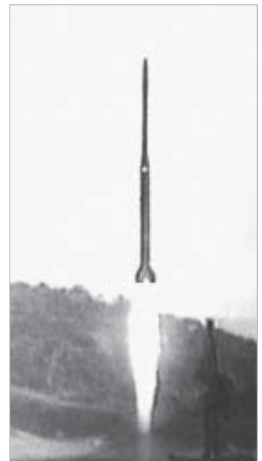
August 1998 photo showing the launch of a North Korean multi-stage rocket.

Previous U.S. administrations relied on incentives-based diplomacy to influence Pyongyang’s behavior. In 1994 the Clinton administration negotiated the Agreed Framework in which economic inducements were used to achieve a verifiable freeze of North Korea’s nuclear weapons program. The previous Bush administration handled the situation in a similar manner in