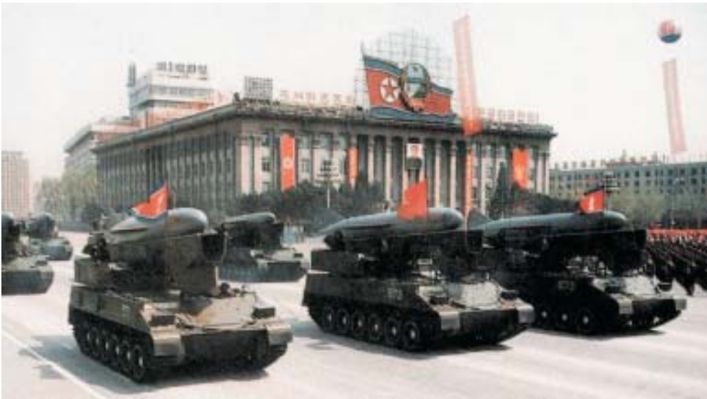
A North Korean military unit carrying missiles during a military parade in Pyongyang.

The goal of U.S. and international policy in Iraq should be a quick end to the military occupation and a rapid political transition leading to full Iraqi sovereignty. Iraqis themselves must lead the transition process and must be allowed to assume their proper responsibilities and sovereign rights in the shortest possible time. Toward this end, the U.S.-led occupation should establish a fixed timeline for the complete withdrawal of U.S. and other foreign military forces and the restoration of Iraqi sovereignty. The United States should forswear any intention to control Iraqi resources or establish long-term military bases on Iraqi territory. This will boost U.S. support among skeptical Iraqis.