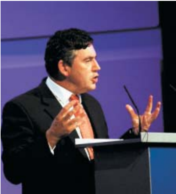
British Chancellor of the Exchequer Gordon Brown challenging the world's wealthiest nations to help the world's poorest countries.

regions as a means of overcoming the poverty and despair that feed terrorism and armed conflict. The British Chancellor of the Exchequer, Gordon Brown, has developed the concept of a global Marshall Fund in which the world's wealthiest nations provide increased development assistance funding of $50 billion a year. This is an initiative that deserves support.