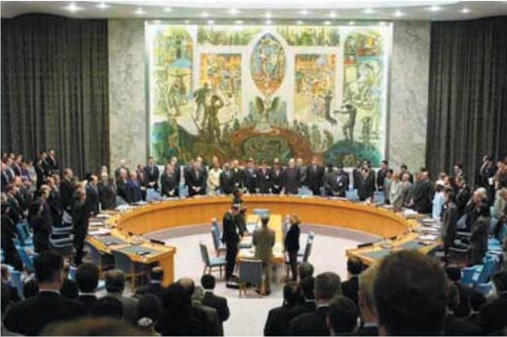
Members of the UN Security Council offer a moment of silence in honor of victims of the September 11 terror attacks.

grievance, but it is important to understand and eliminate the factors that cause terrorism. The campaign against terrorism must seek to drain the swamp from which terrorists emerge, and reduce the grievances and hostilities that terrorists exploit.