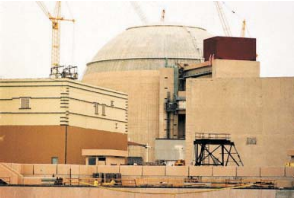
Russian-built Bushehr nuclear power reactor in southwestern Iran, which Washington fears is part of a program to build nuclear weapons.

multilateral disarmament, the strengthening of international institutions, and carrots and sticks diplomacy, the United States can protect itself against terrorism and weapons of mass destruction and realize a more secure future.