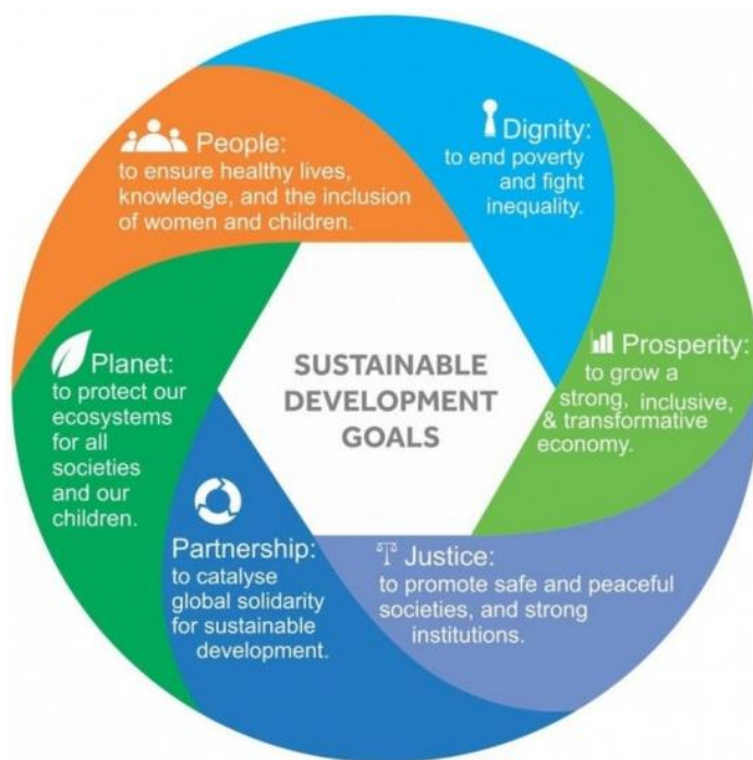
2. Source: The road to dignity by 2030, Synthesis report of the Secretary-General on the post-2015 sustainable development goals

The UN Regional Economic Commissions (RECs) and the UN Non-Governmental Liaison Service (UN-NGLS) have become active participants in the SDG consultation processes. Both groups have published key reports on how to apply the new framework with enhanced partnerships. 16 Collaboration with the