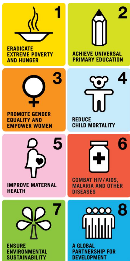
1. Source: The MDGs, UN Millennium Project, http://www.unmillenniumproject.org/

The MDG framework did not encompass the required indicators to ensure the ultimate goal of eradicating poverty within fifteen years. 1 The drafters of the MDGs strongly urged that the outcomes of the MDG process be quantifiable, but the creation of indicators to monitor and evaluate the goals missed many roots causes of poverty and inequality. 2 These gaps in the MDG measurement framework led to policies that could not successfully accomplish the stated goals or build greater equality across North-South, ethnic, and gender divides. The focus on meeting the designated targets rather than developing multidimensional policies to achieve the goals has been criticized as a flawed approach to eradicating poverty. 3